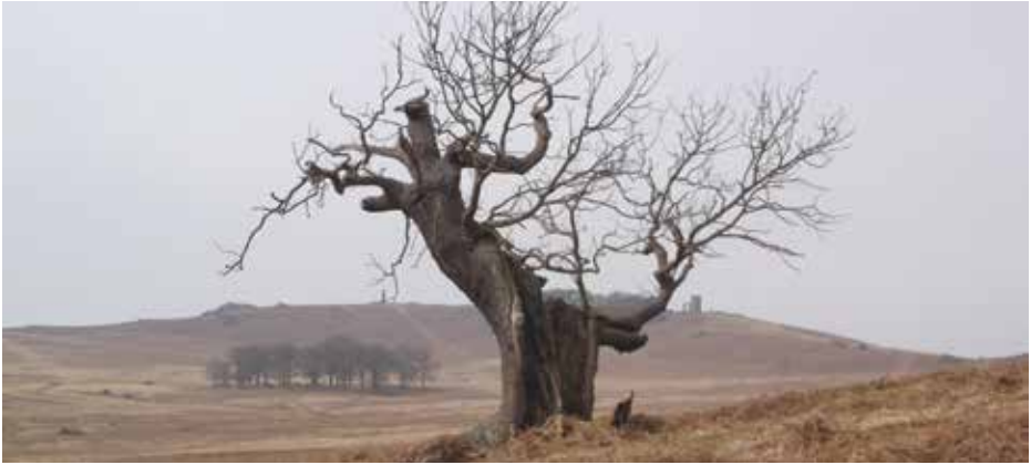
The ancient oak-tree in Bradgate Park, Charnwood Forest.