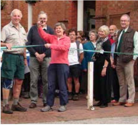
Opening the Wyche Way at Kington.

which runs between Kington and Broadway in next-door Worcestershire.